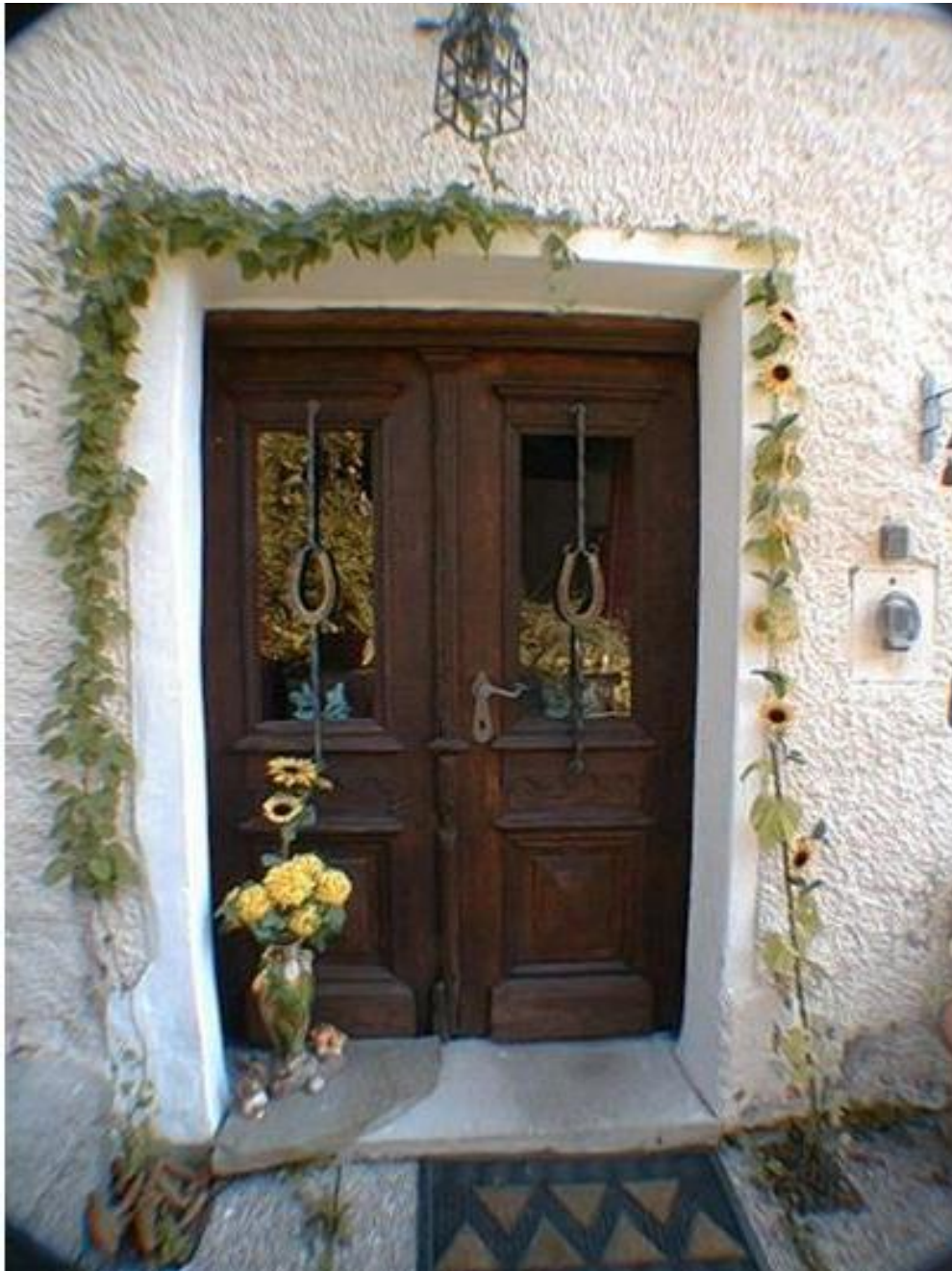
Ranchette in Gitschtal Southern Austria